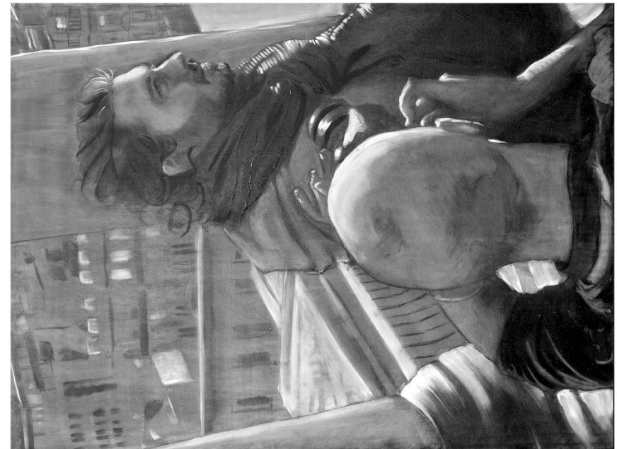
The Temptation by I.D. Campbell The Gospel of Luke, Chapter 4