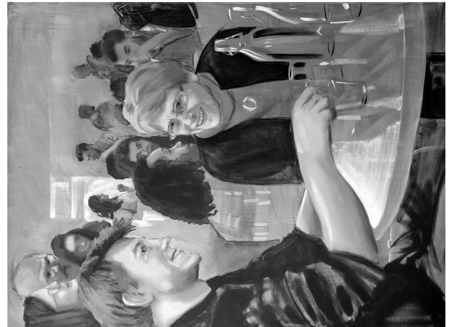
The Great Banquet by I.D. Campbell The Gospel of Luke, Chapter 14