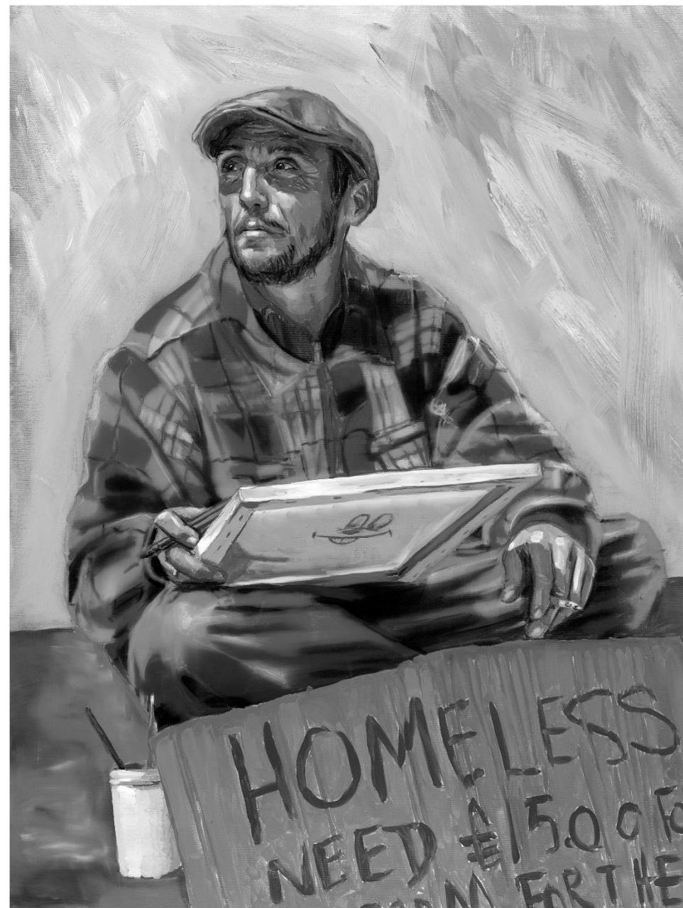
Blessed are the Poor by I.D. Campbell The Gospel of Luke, Chapter 6